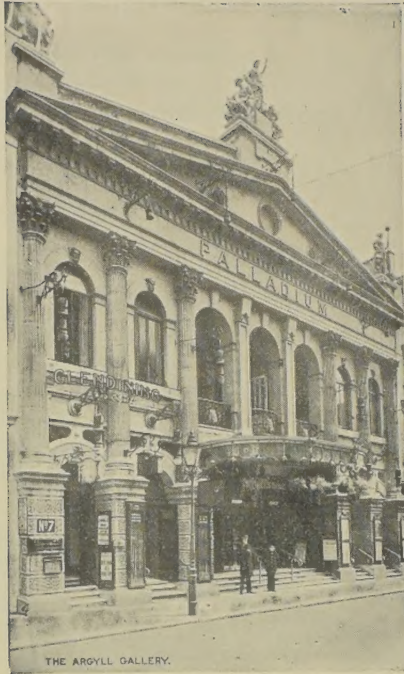
THE ARGYLL GALLERY.

THE ARGYLL GALLERIES, 7, ARGYLL STREET, OXFORD CIRCUS, W.1.